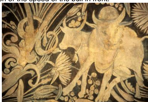
Plate 5 Two bulls at Bagh Caves

The force of the bull and the characteristics resemble with that of the couple bulls found in the wall paintings of the Bagh caves. The whole composition is the replica of this bull except the second bull which is seeing in different direction and unaware of the action or the speed of the bull in front.