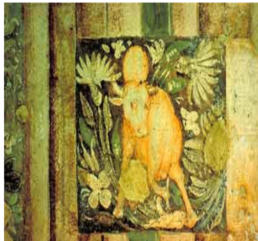
Plate 3 Nandivishala Jatak, Cave No. 1 Ajanta Caves

An aroused bull can also be noticed in the wall paintings of cave 1 where the bull is facing the spectator in a very angry mood. Its motion of the body is very rhythmic and forceful. It looks as if the bull is coming toward the person who is watching it and suddenly will attack. The forceful movement and energy of the bull is noteworthy. The eyes are very impressive and message giving. It seems it is observing the person in front and after will take any decision. It can also be assumed that it came running with energy and speed and suddenly stopped after observing something different in the shrubberies or foliage. Its one hind leg is stretched in force and one foreleg is uplifted to run ahead. It seems doubtful and seeing in all directions to observe the happening. Its ears are alert to notice and hear the sound and its eyes are observing the situation. The hump of the bull is huge and lumpy. In all the background of the composition also supports the movement of the bull. The big flowers seem to be swinging in the environment due to the aggressive movement of the bull.