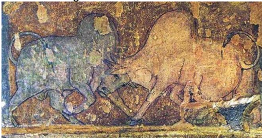
Plate 1 'Fighting Bulls' a painting on the pillar of Cave No.1 Ajanta Caves

Another mood of the bulls can be seen in the 'reclining bulls' of cave 17 in which the bulls are stretching out on the ground in which one of the bulls is almost drowned, closing its eyes, stretching neck up to limit, its legs are also stretched in any direction. It has a huge lumpy hump. It seems as if these were tired too much and cannot move ahead. These might be the bullocks or roaming bulls. The bulls are taken out in line drawings and filled in with very light colours. Both the bulls look similar in size and attitude. The other bull is also lying down but seeing upward with open eyes. The ground is shown very dark whereas the bulls are light in colour. The line drawing highlights the expressions of the bull prominently. Again a motion can be observed. The eyes travel with rhythm in the painting. The line in the hump shows the movement of the hump which is bulged. All types of elements can be seen in the painting 'Reclining Bulls'