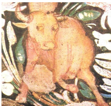
Plate 4 Detail of the Bull

According to the Jatak stories, this is the story of Nandivishala. Gautam Buddha took a birth of a bull named Nandivishala who was a reared bull of a Brahmin. Once a calf was given to a Brahmin, who called him Nandivishala and treated him with care and affection. When the bull grew up he felt obliged because the Brahmin had reared him up with care. To repay the expenses incurred toward his upbringing, he decided to help him. So, one day, he advised the Brahmin to put a wager of one thousand coins to prove that he possessed the strongest bull in the village, who could drag one hundred loaded carts. The Brahmin accepted the proposal and made the wager of one thousand gold coins in the local market to prove the strength of his bull (Varma).