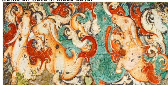
Plate 6 The leaping bulls

In one of the wall painting, a decorative and ornamental design of bulls like image is found which are seen in the design of foliage. These are leaping in the fields whose forelimbs are hanging above the ground and the hind limbs are hidden in the shrubs. One of these four bulls is painted in turquoise green and the rest of them are in pale yellow colour having impressions of details around neck. The horns of the bulls are sharp and straight and shown downward as these are leaping and seeing towards the sky. It gives an effect of slow motion seen in the movies today. The form of these bulls merges with that of the foliage in the background, middle ground and the fore ground. A soft movement of the leaps is noticed which gives a heavenly impact as if these were roaming in heaven. Another important aspect which can be observed is the rhythm in which all these are leaping. The eyes search for the images in the whole composition and after exploring the spectator feels skill, expertise, dexterity and proficiency of the artist who created such marvellous and unbeatable art works on walls in those days.